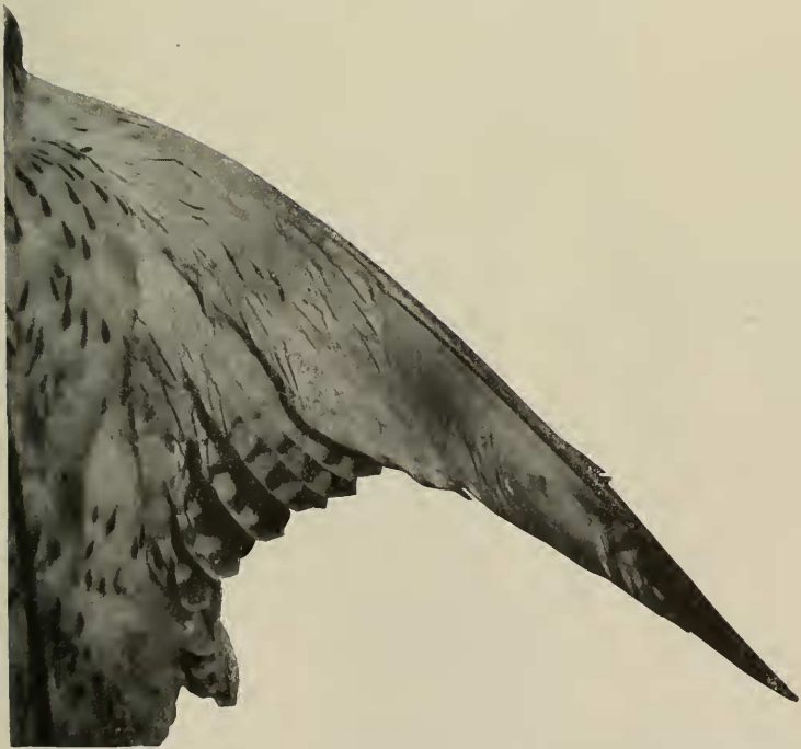
Falco islandus , White Gyrfalcon, female. (No. 608 collection of W. F. H., February, 1906, Kangek, near Goodhab, Greenland.)